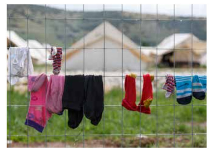
Washing hanging on the fence at Katsikas Camp, Epirus.

"Before we took our children and family over the sea, now we will take them over land. What other option do we have?" Syrian male, Filippiada Camp, Epirus