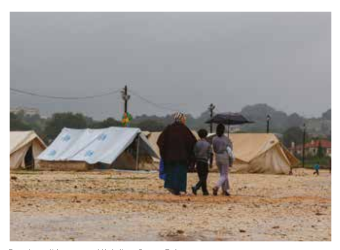
People walking around Katsikas Camp, Epirus.

"When there is a fight, the police show up late. Like in the movies." Fatima, 19, Syrian female, Moria closed facility, Lesvos